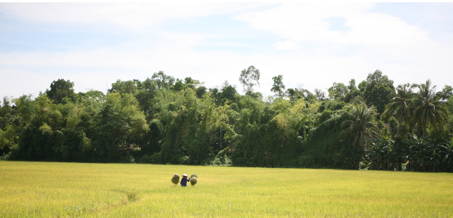
Harvest Season. Vietnam.