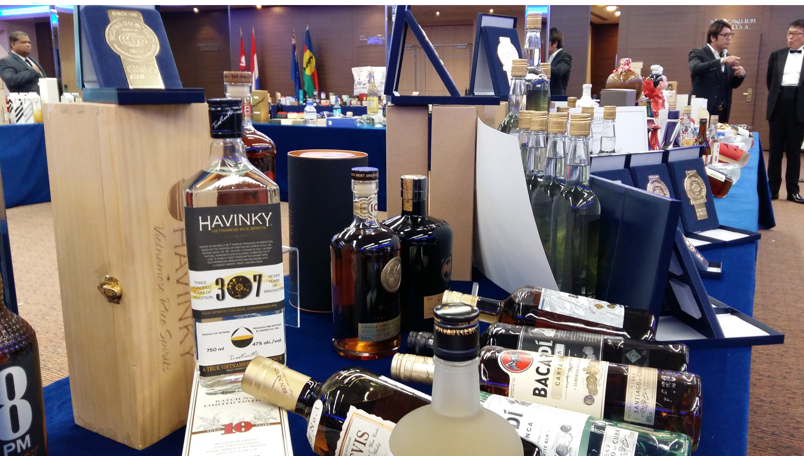
Havinky at the 57 th Annual Awards Ceremony held by Monde Selection. Rome 2019.