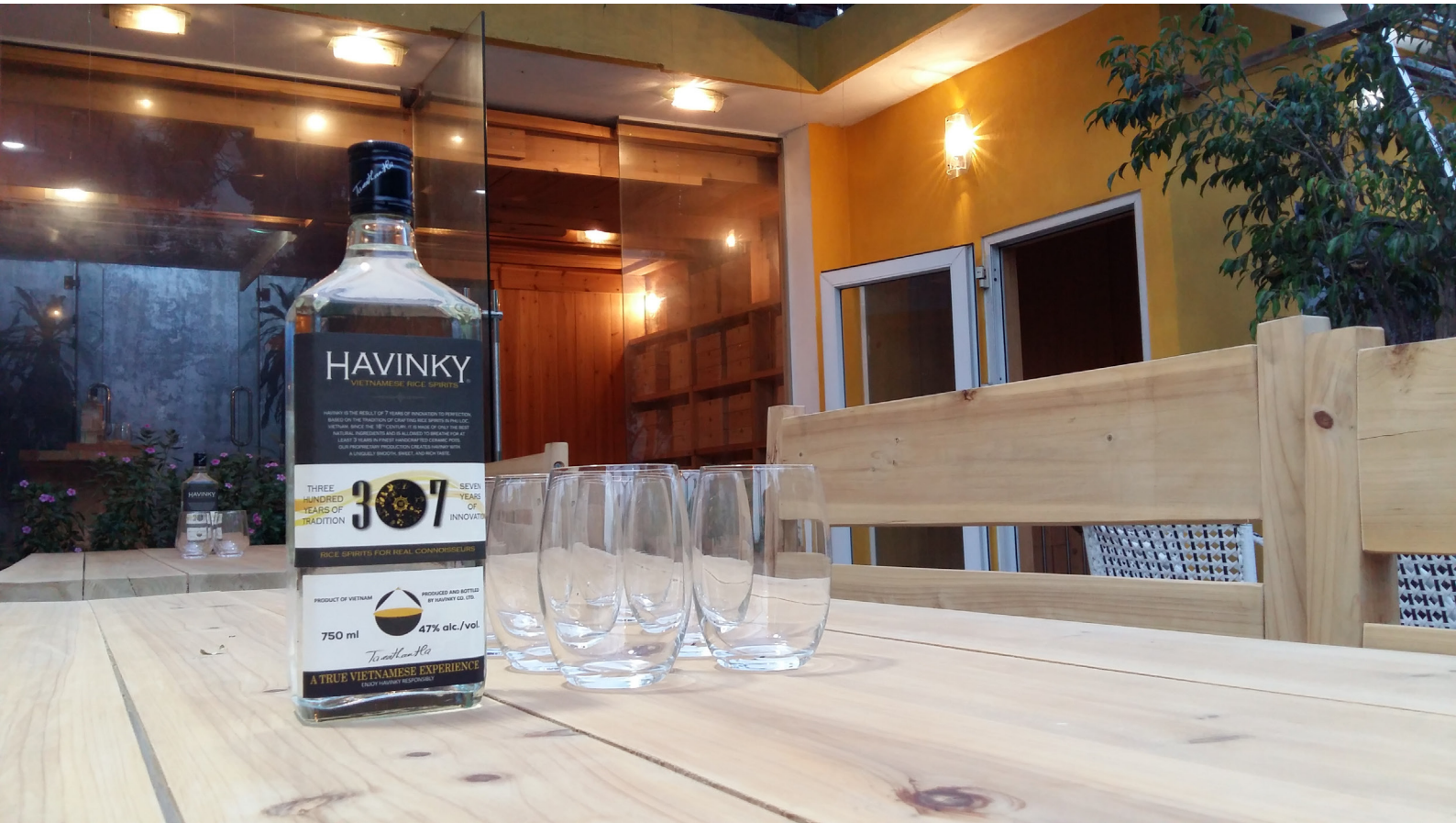
Havinky's Tasting Venue, 4 th Floor, 986 Lang Street, Dong Da District, Hanoi City.

Havinky Co., Ltd received the prestigious International Award by Ultimate Beverage Challenge in April 2019.