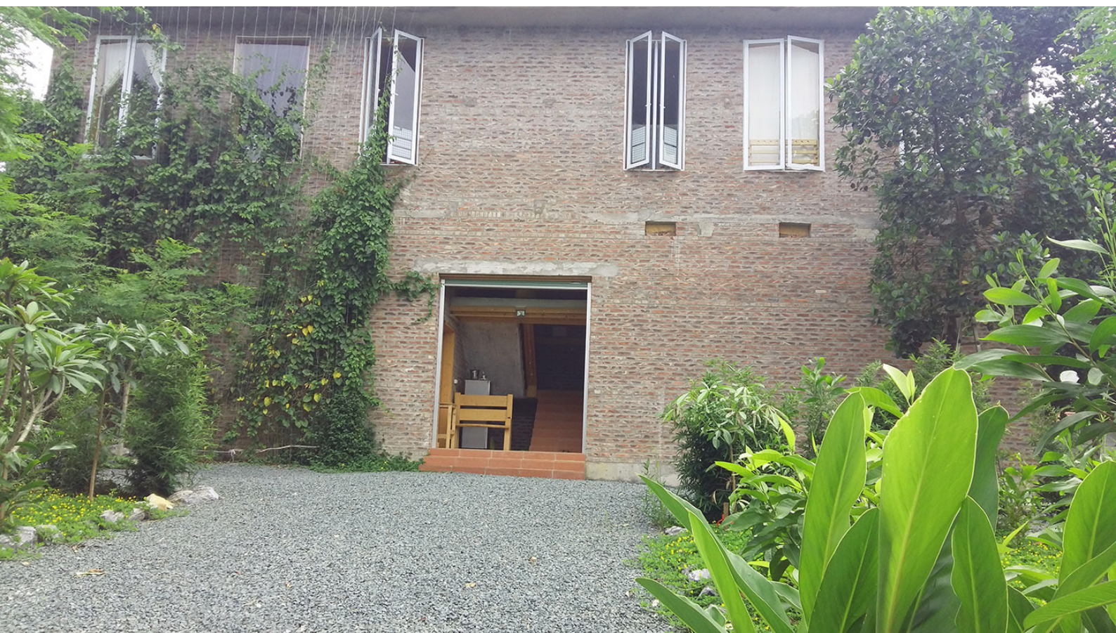
Havinky's Warehouse. Hoa Son Commune, Luong Son, Hoa Binh, Vietnam.