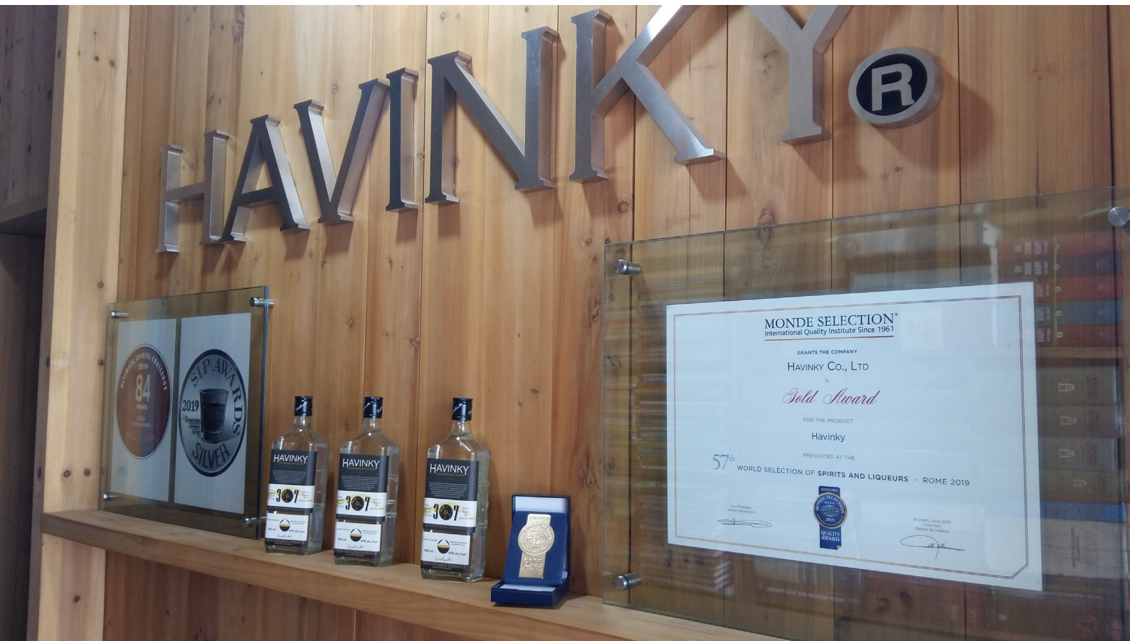
Havinky's Shop, 1 st Floor, 986 Lang Street, Dong Da District, Hanoi City.