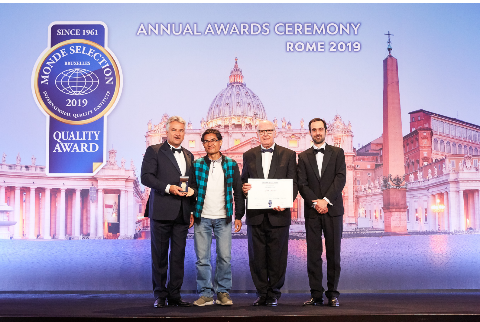
Havinky's Director, second from the left, received a Gold Quality Award by Monde Selection. Rome 2019.

Havinky Co., Ltd received the prestigious International Quality Award during the 2019 Annual Awards Ceremony held in Rome, Italy on June 3 rd .